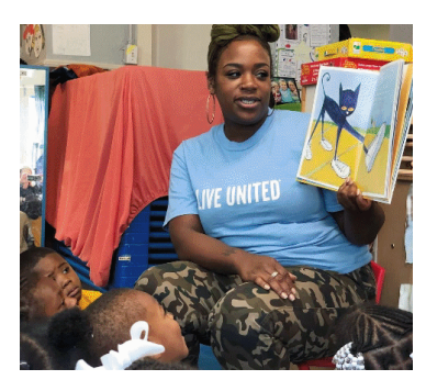
Marists: Helping People in Need What can you do?